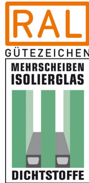
RAL Quality Label 520/2-3